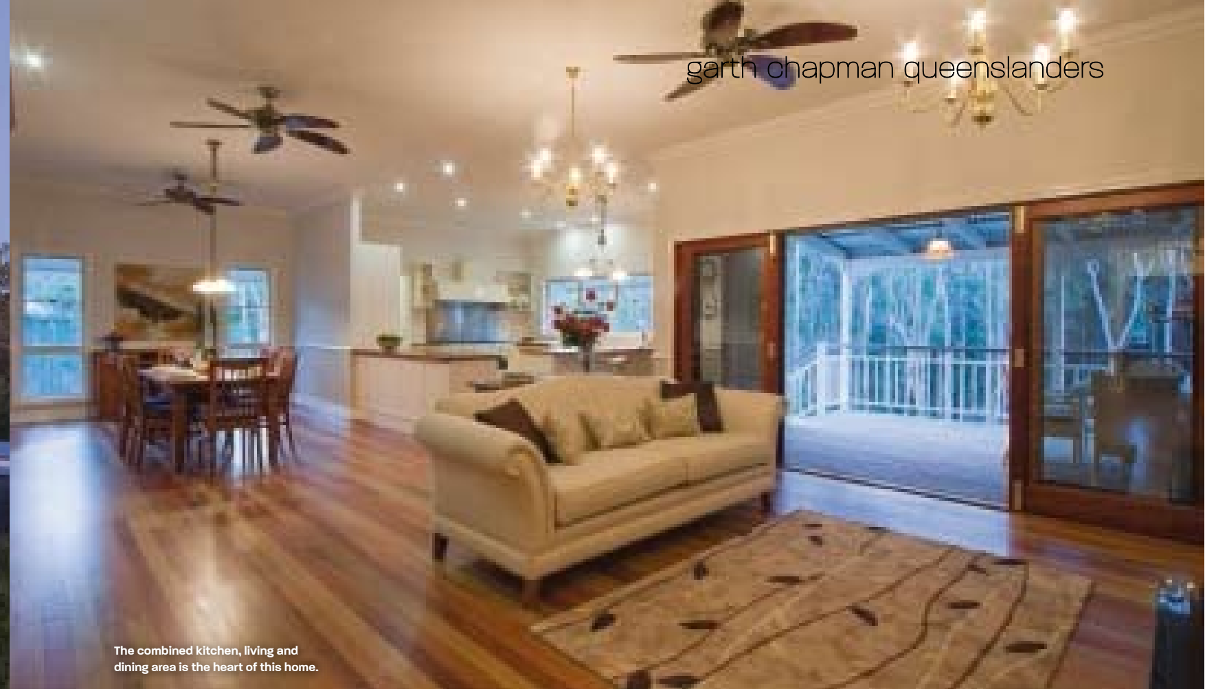
The combined kitchen, living and dining area is the heart of this home.