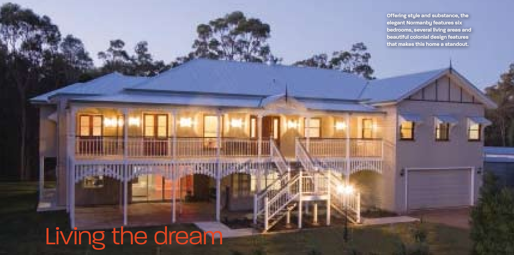
Offering style and substance, the elegant Normanby features six bedrooms, several living areas and beautiful colonial design features that makes this home a standout.